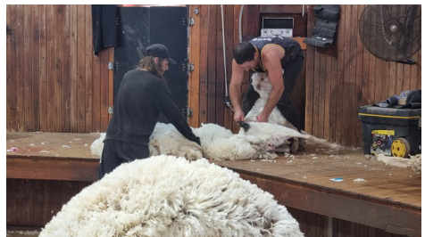
Pastora teams wool at Condoblin

If the consultant and certain non-mulesing studs denigrating wether trials were correct, then both clients would be well below the industry average, but their results are not, meaning the consultant is full of BS paid by certain studs to promote their propaganda! Maybe these non-mulesing studs should enter the next wether trial and show our bloodline up! This is a direct challenge to some of the biggest non-mulesing studs in the industry. I doubt that they will as they are concerned about how they will go!!! This is not directed at all non-mulesing studs or consultants, just the ones making outrageous statements about their sheep and the consultant paid by them