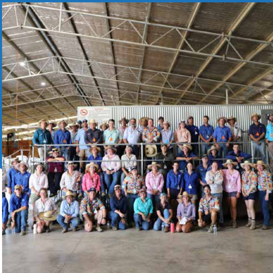
2024 PWS Wyvern weekend participants.